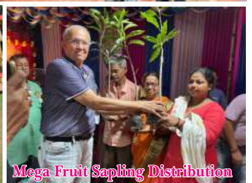
Mega Fruit Sapling Distribution