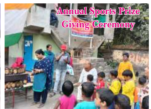
Annual Sports Prize Giving Ceremony