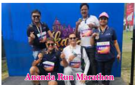
Ananda Run Marathon