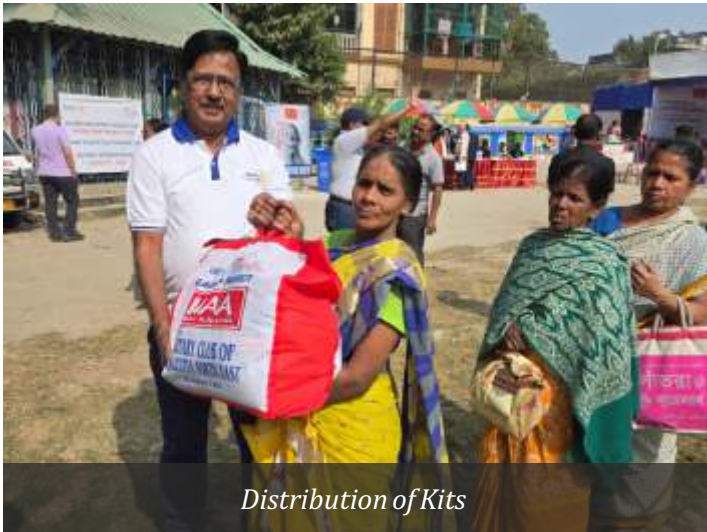
Distribution of Kits