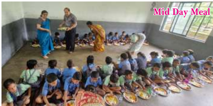
Mid Day Meal