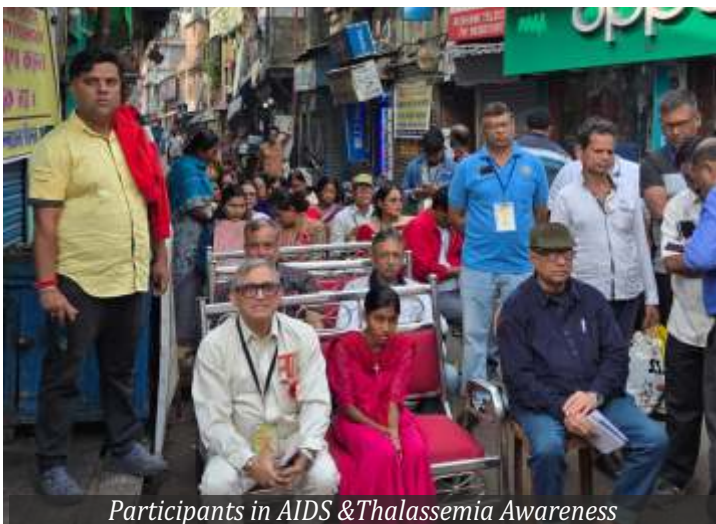
Participants in AIDS & Thalassemia Awareness

On World AIDS Day, our Club, in association with Rotary Calcutta Endeavour, organised an awareness campaign on AIDS on 1st December 2025. Along with the campaign, we also distributed Thalassemia medicines to five affected children. This initiative is a legacy project of our club and has been successfully continued for the past eight years.