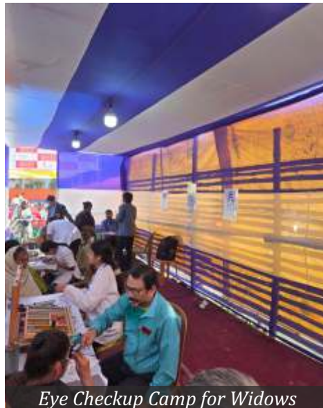
Eye Checkup Camp for Widows