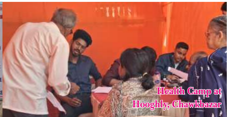
Health Camp at Hooghly, Chawkbazar