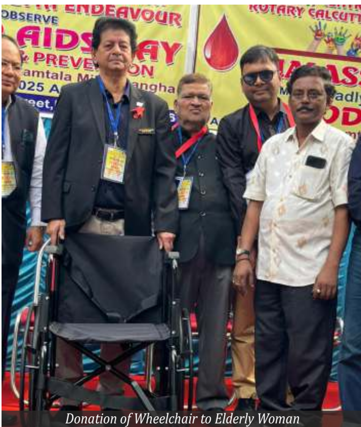
Donation of Wheelchair to Elderly Woman