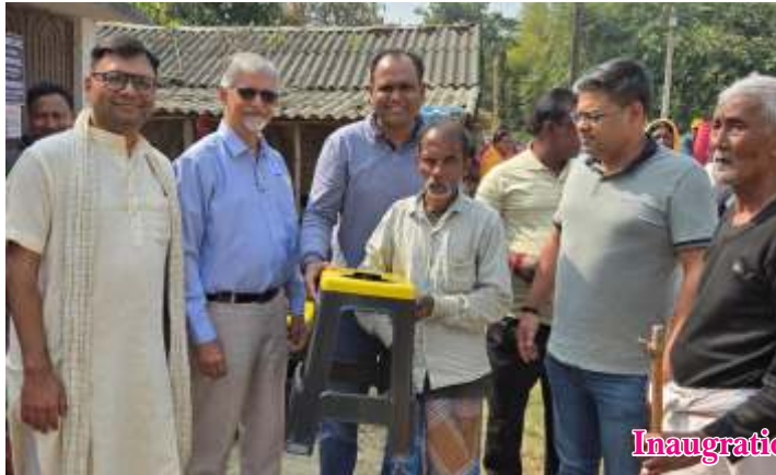
Inauguration of Toilets