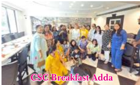
CSC Breakfast Adda