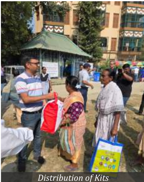
Distribution of Kits