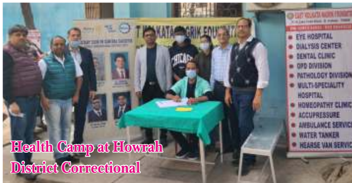
Health Camp at Howrah District Correctional