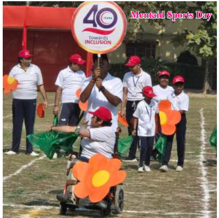
Mentaid Sports Day