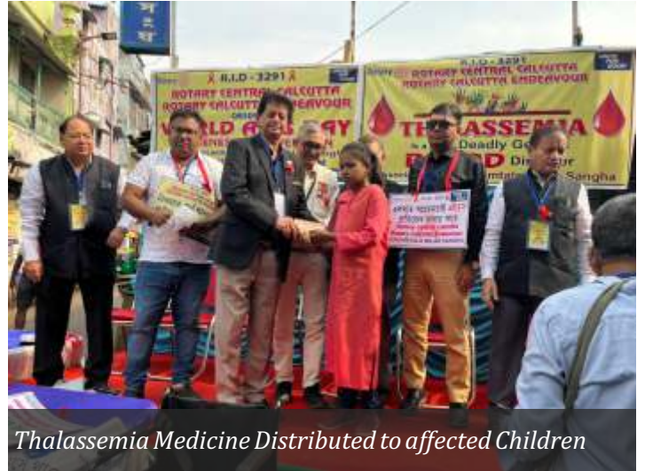
Thalassemia Medicine Distributed to affected Children