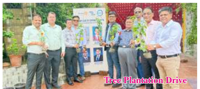
Tree Plantation Drive