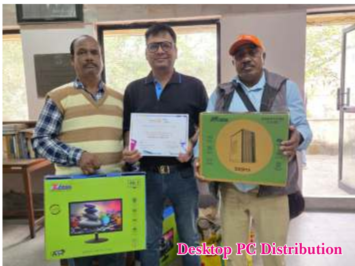
Desktop PC Distribution