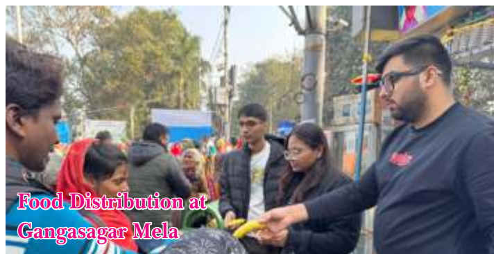
Food Distribution at Gangasagar Mela