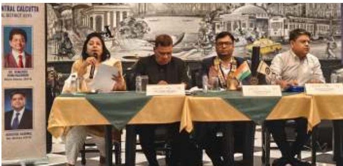
IPP Announcement of New Committee for RY 26-27