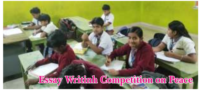
Essay Writing Competition on Peace