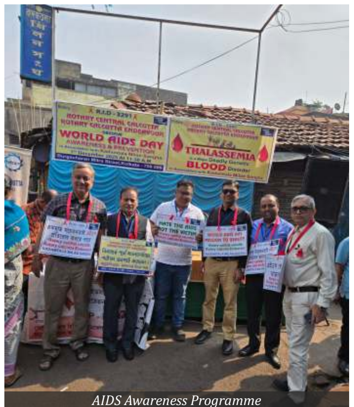
AIDS Awareness Programme